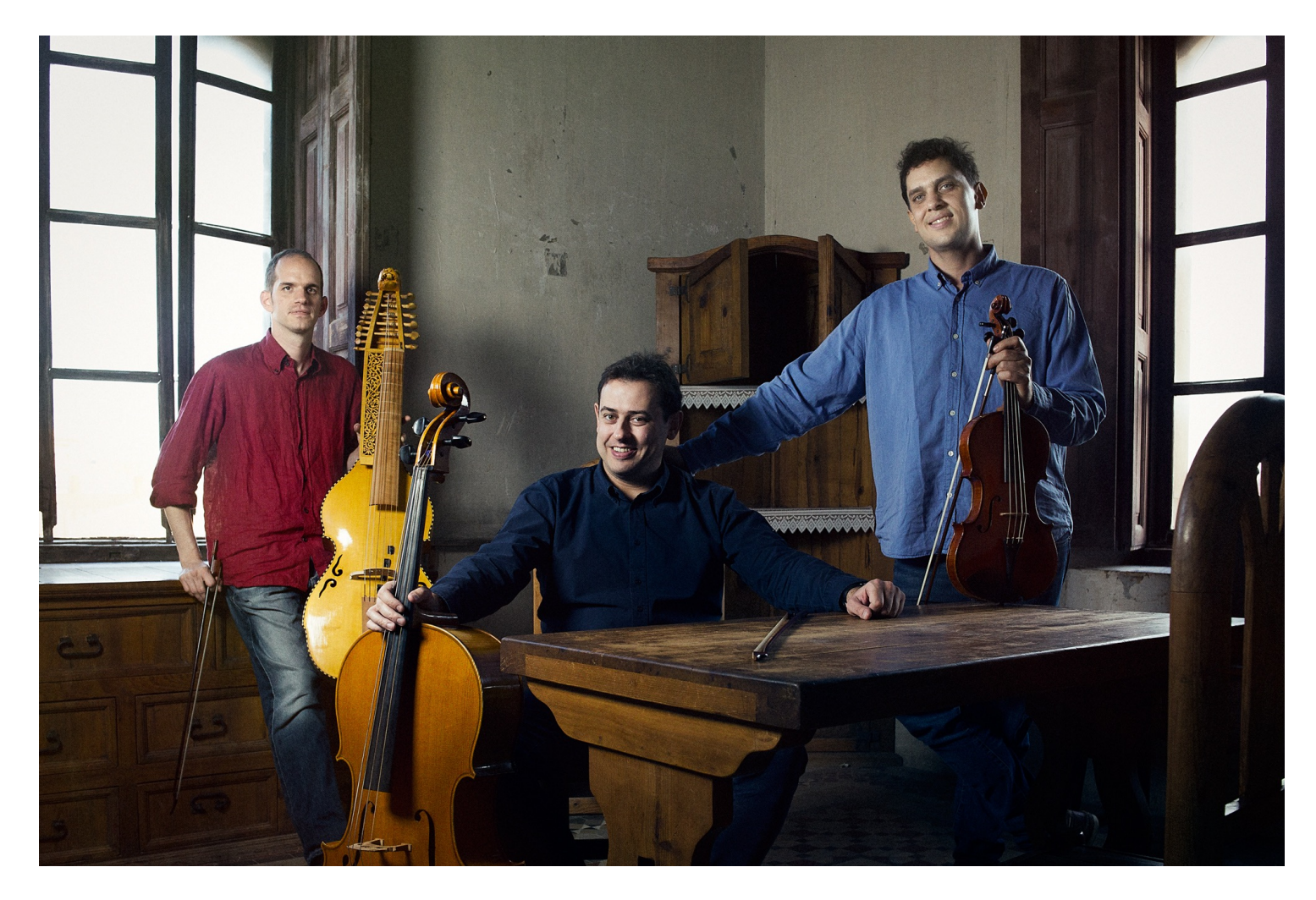
The traditional formation of the Haydn Baryton trios - Baryton, Viola and Violoncello